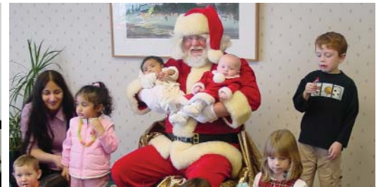
Right: A special visit from Old St. Nick at the children's holiday party.